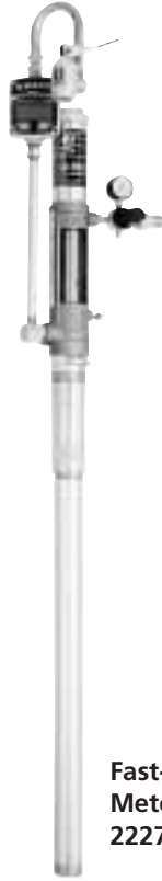
Fast-Ball 1:1 Metered pkg. 222702