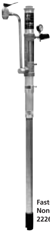
Fast-Ball 1:1 Non-metered pkg. 222602