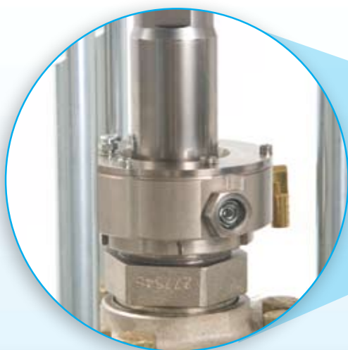
Sealed Wet Cup

Long-Lasting Piston Pumps with Sealed Wet Cup